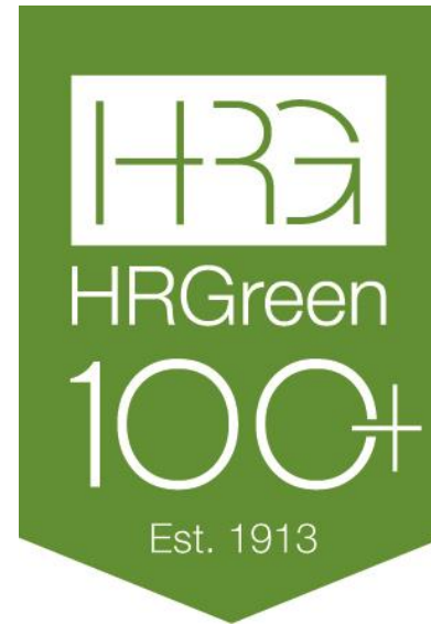
HR Green, Inc.