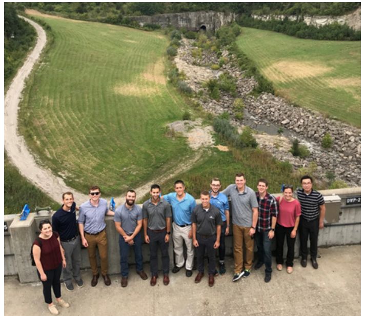
The Young Professionals Group at the Elmhurst Quarry