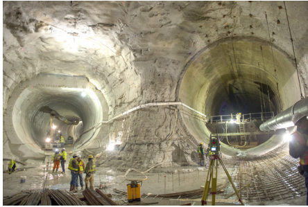
Construction at the confluence of the McCook Reservoir Connecting Tunnel (left) and Mainstream Tunnel (right)

The smallest of the TARP reservoirs, Gloria Alitto Majewski Reservoir was completed in 1998. Thornton Reservoir was completed in 2015 and yielded nearly instant benefits. The first stage of McCook Reservoir went