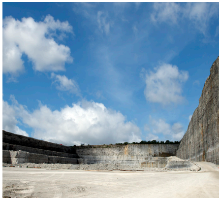
The 7.9 billion gallon Thornton Reservoir, part of the Calumet TARP system.

The Tunnel and Reservoir Plan (TARP), also known as “Deep Tunnel,” is a system of deep, large diameter tunnels and vast reservoirs designed to reduce flooding, improve water quality in Chicago area waterways and protect Lake Michigan from pollution caused by sewer overflows. TARP captures and stores combined stormwater and sewage that would otherwise overflow from sewers into waterways in rainy weather. This stored water is pumped from TARP to water reclamation plants (WRPs) to be cleaned before being released to waterways. The four TARP tunnel systems are designed to flow to three huge reservoirs, and the system will have a capacity of 20.55 billion gallons when complete. That is 5,480 gallons for each person in its service area. One of the largest civil engineering projects on earth, TARP has been extremely effective and widely emulated since the initial tunnels went online in 1981.