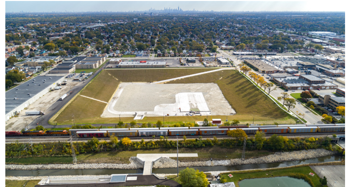
The Addison Creek Reservoir provides nearly 200 million gallons of storage capacity and connects with the Addison Creek Channel (at bottom). Photo taken October 2022.

The MWRD and Bellwood have an intergovernmental agreement (IGA) for the construction and perpetual maintenance responsibilities of the Addison Creek Reservoir Project. The IGA stipulates that the MWRD will design and construct the reservoir, and the village of Bellwood and MWRD will share the maintenance responsibilities of the reservoir.