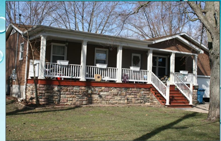
This home is one of the dozens of damaged Watseka structures from 2008 floods that received ICC funds to elevate above the base flood. The home did not receive damage during this flood, while neighboring home did.

Call out Feb 25, 2018 Deploy March 2, 2018 (676 buildings)