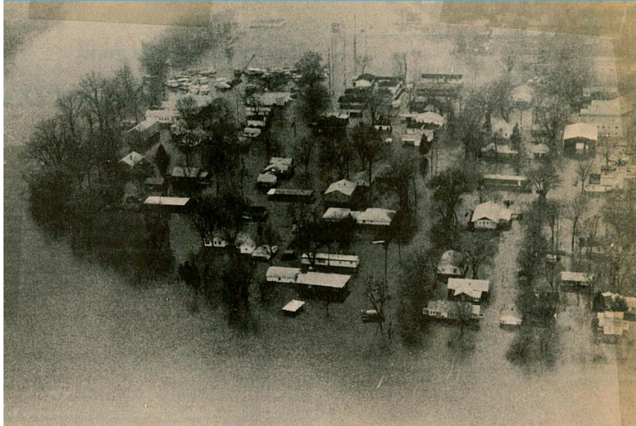
1982. The Ottawa “flats”. Under water.