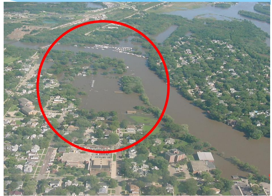
2008. The same Ottawa “flats” After buyouts.