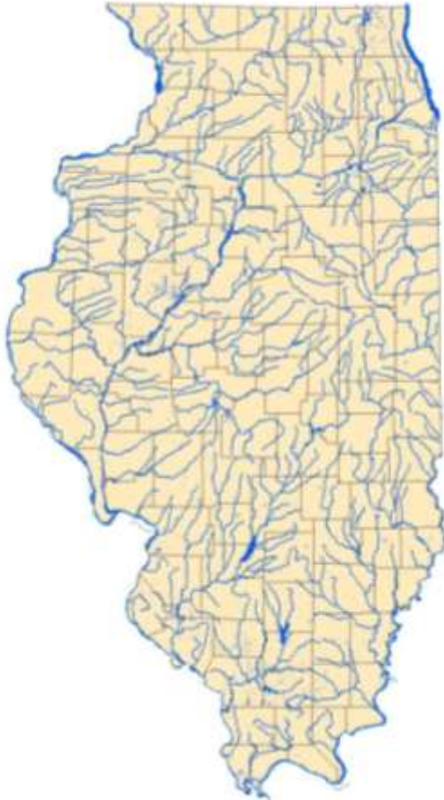
Illinois' Rivers, Lakes, & Streams

Floods occur SOMEWHERE in Illinois every single year.