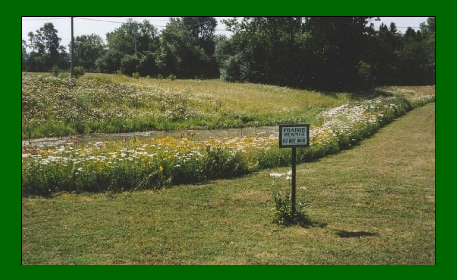
"Lack of proper post-construction maintenance is definitely a reason..."