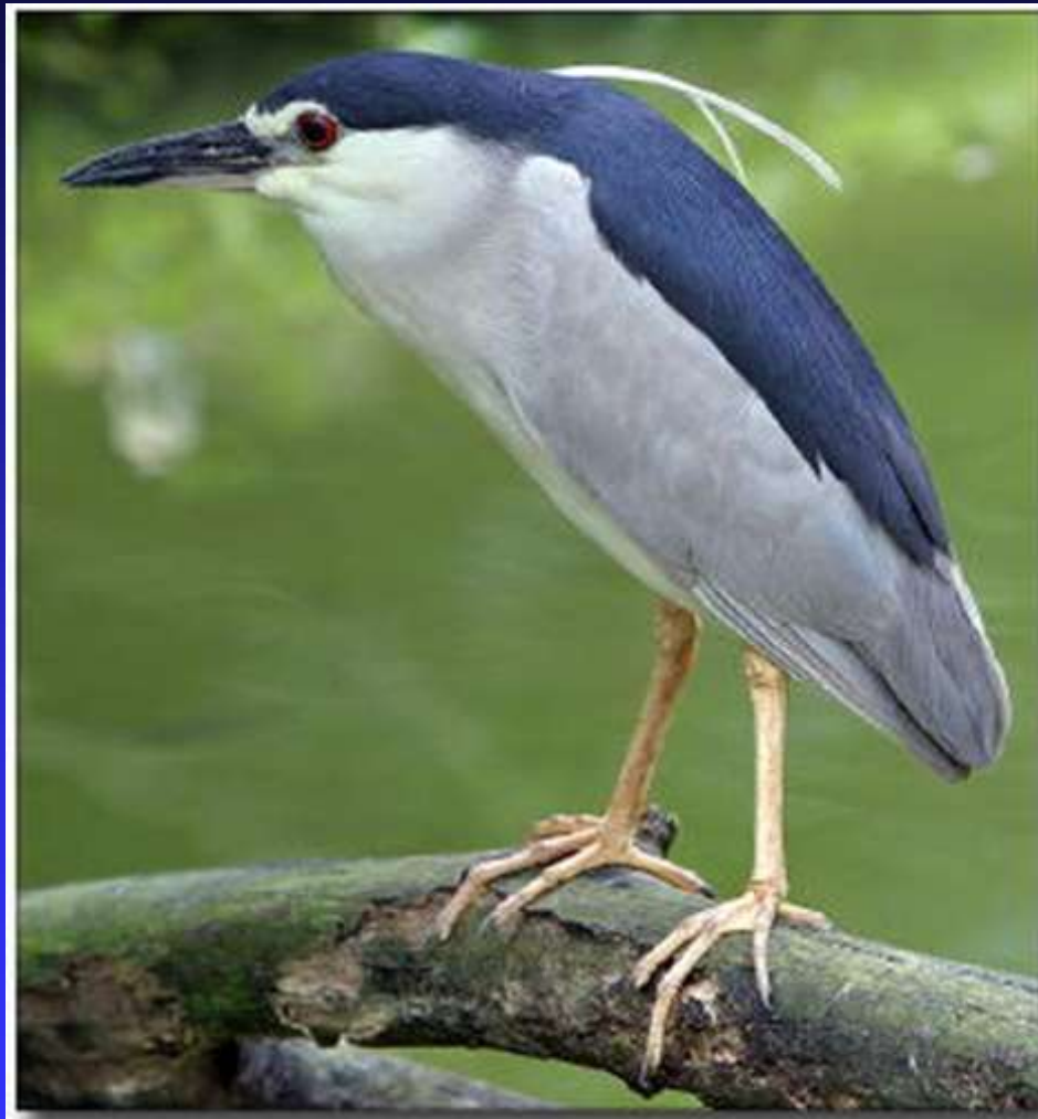
Black Crowned Night Heron