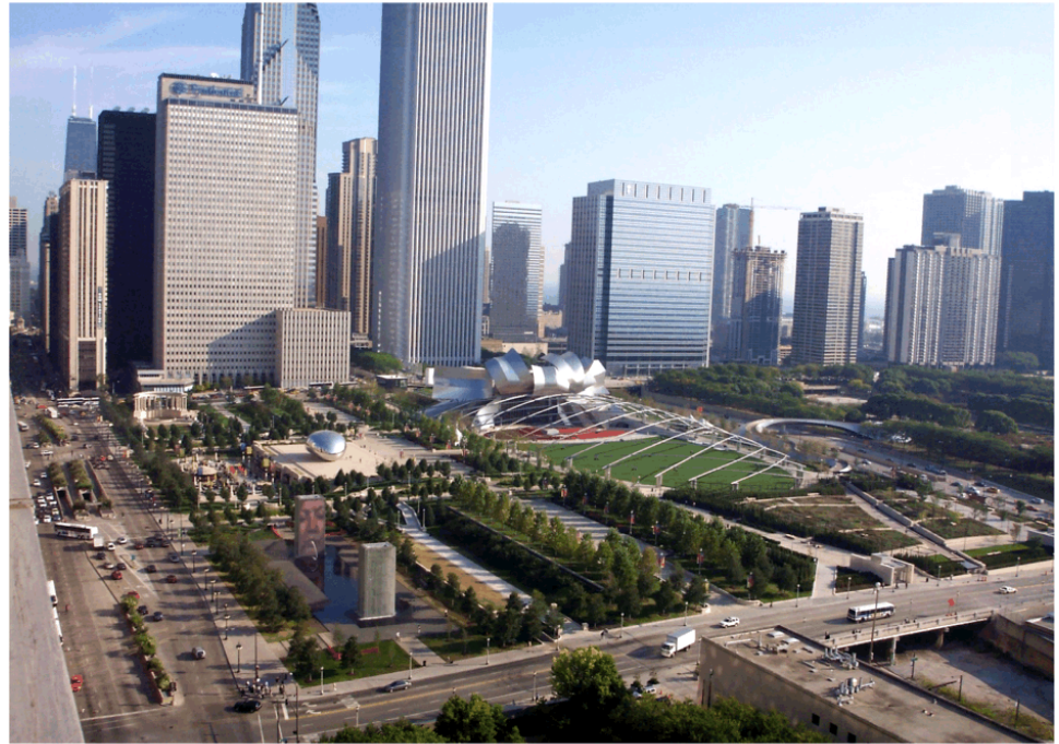
Millennium Park in Chicago